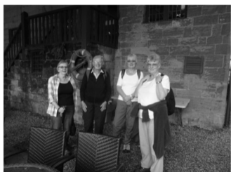
Some of us on a recent walk around Old Milverton