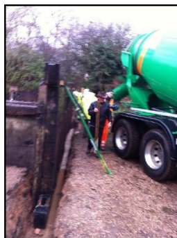
Installing Lock Gates display 2013