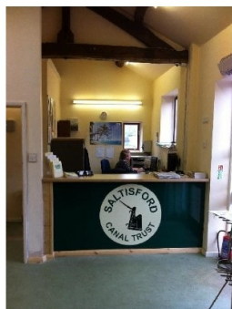
Visitor Centre and Shop