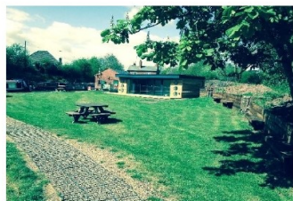
The Cedar Room – completed 2015